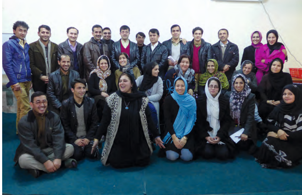
The Ipsos team in the training center of Kabul.

We wish to contribute that the people of our world are conscious, creative, taking responsibility for themselves and their environment; proud to be who they are, reaching out in dialogue relating to the others and the world – passionate – curious – empathetic.